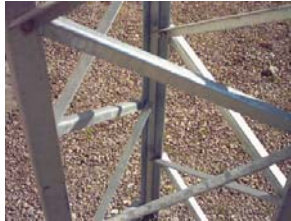
Triangular bolted section SR5

Our tower-structures are wholly of steel, modular and hot-galvanized. Bolted construction is used throughout the tower for a couple of good reasons. Mainly this gives the owner the choice of having the tower shipped unassembled (knocked-down) in kit form, and also offers the ability to replace tower components in the field with just a wrench, should a structural member ever become damaged. Shipping in kit form can also save a bit on freight costs to the delivery point. Tower sections are connected together with 24 bolts per connection, using steel splice plates on both the outside and inside of each leg intersection, forming an extremely strong and positive joint. Some radio-antennas, fixed or rotative, can be placed at the structure top by special supports. In case of rotative antennas, special supports can be inserted in the inside of the last module to fasten rotators of our production and all the others present on the market. Furthermore the mast can be locked by a thrust-holder bearing support and guided by supports having nylon bushings.